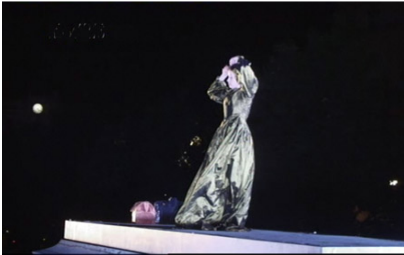
Tiff's hour on the plinth (1 st September) was spent changing from male to female.

I warn you, I'm the kind of bard Who writes iambs by the yard, Or even sometimes by the mile. This poem could take quite a while.